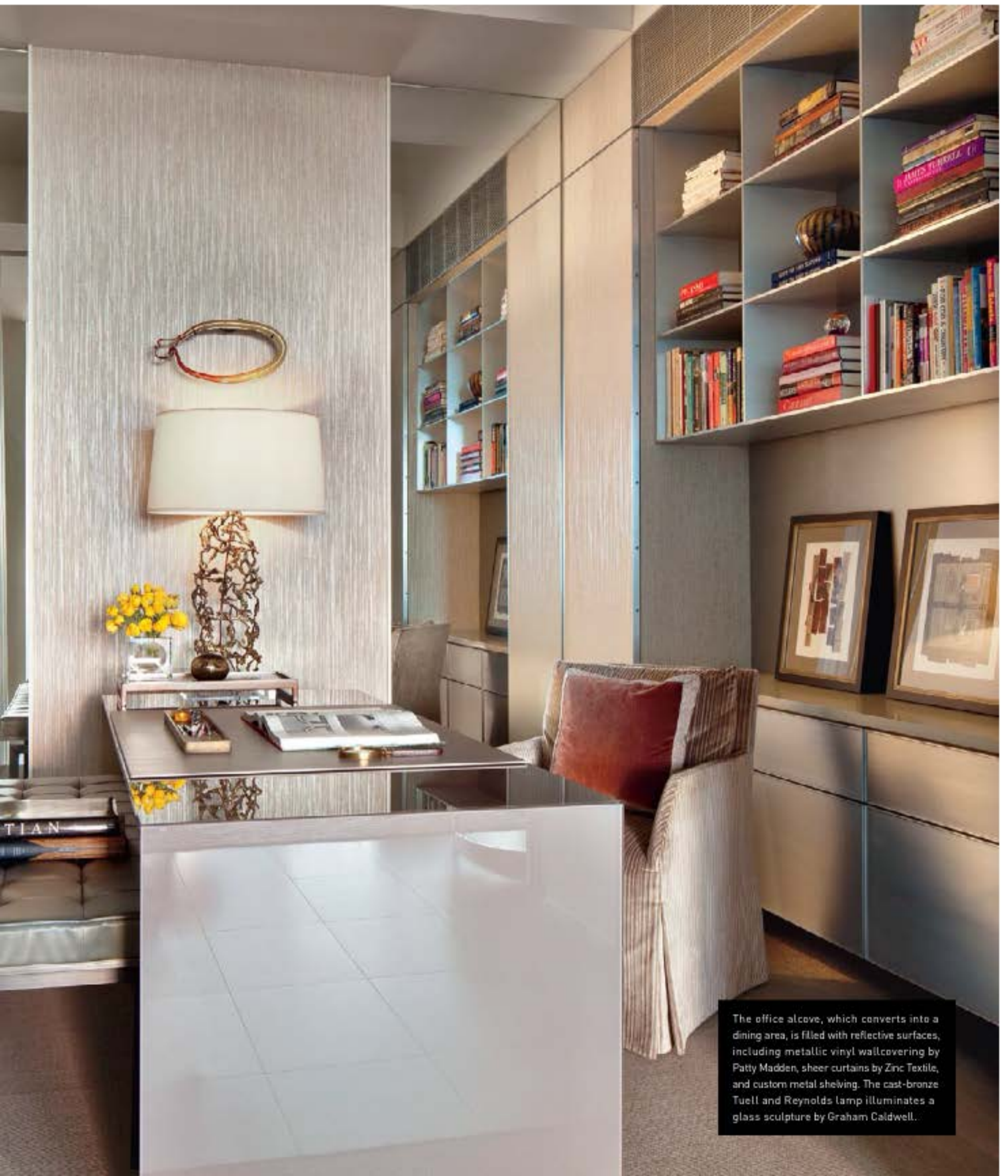
The office alcove, which converts into a dining area, is filled with reflective surfaces, including metallic vinyl wallcovering by Patty Madden, sheer curtains by Zinc Textile, and custom metal shelving. The cast-bronze Tuell and Reynolds lamp illuminates a glass sculpture by Graham Caldwell.