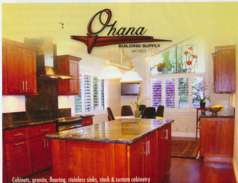
Cabinets, granite, flooring, stainless sinks, stock & custom cabinetry

VENTILATION HOOD: Faber from Sierra Select Distributors