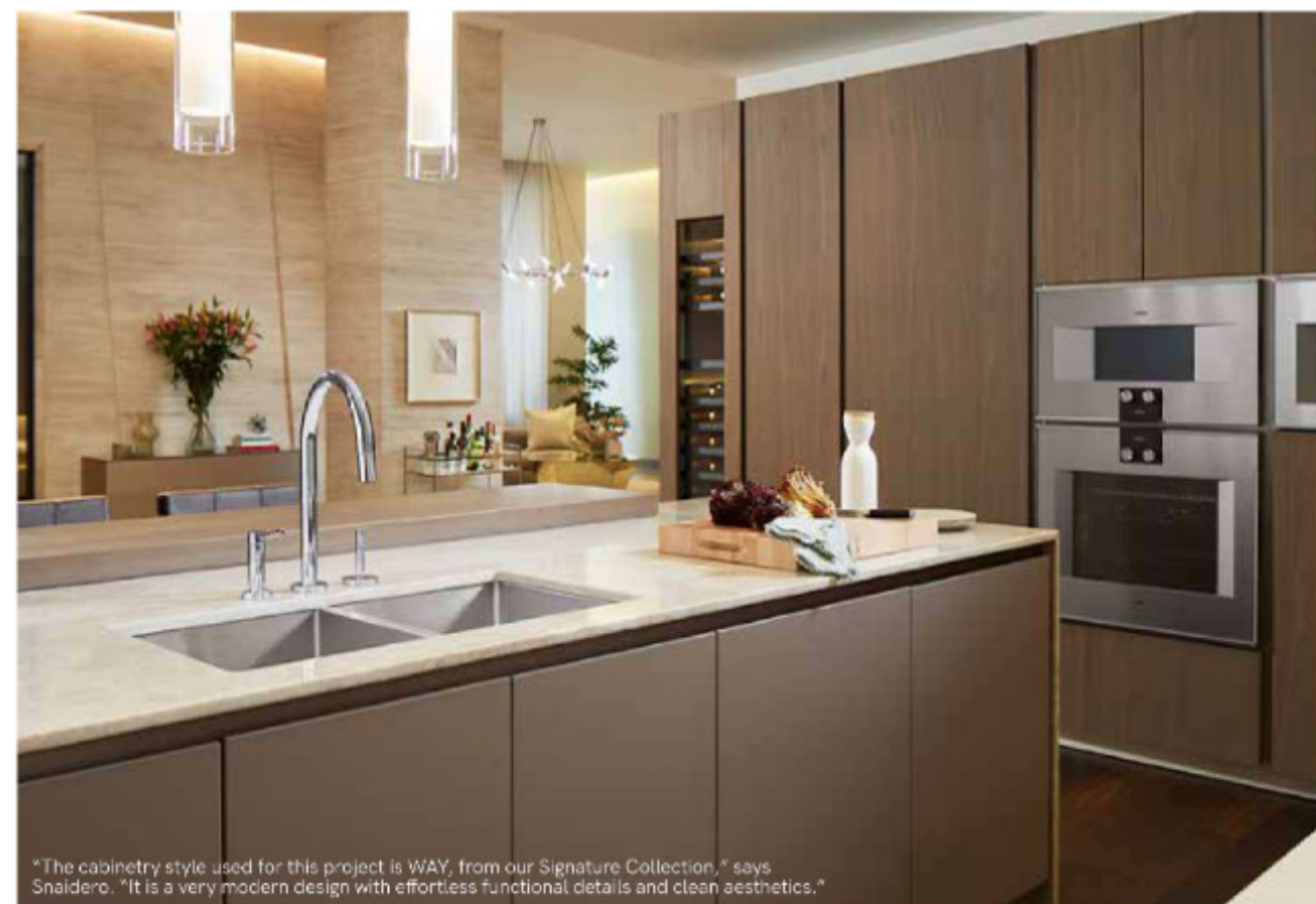
"The cabinetry style used for this project is WAY, from our Signature Collection," says Snaidero. "It is a very modern design with effortless functional details and clean aesthetics."