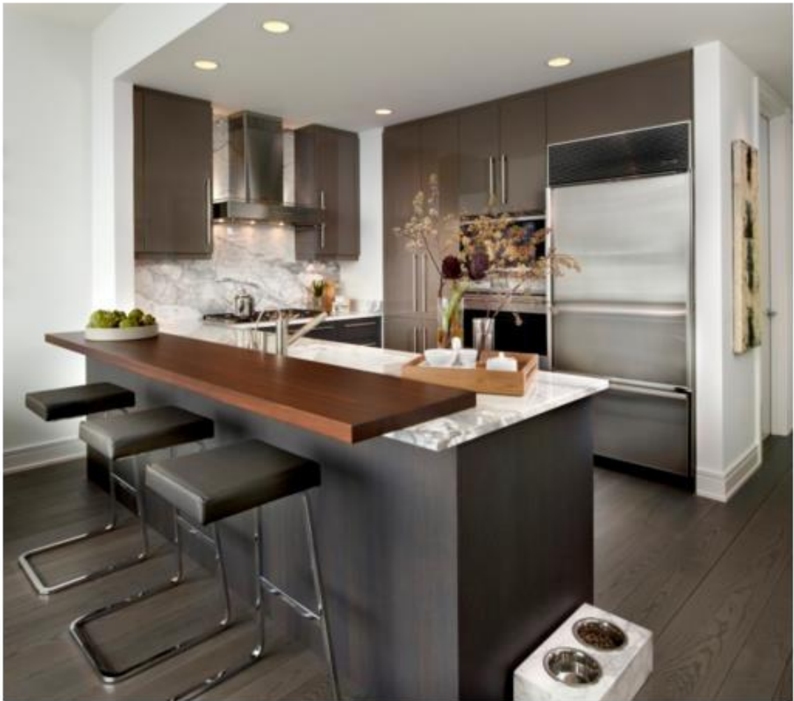
Note the dog bowls!

People are getting away from stainless steel, which reflects darkly and requires a lot of maintenance, and brown and bronze appliances are taking its place. Gray is by far the top color for cabinetry, because it is a good, calming neutral. Also, smart appliances that can be connected to your home (and will, for example, notify you if your oven is still on) are also becoming very popular.