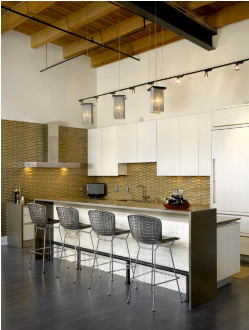
Tony Soluri Photography