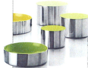
Paul Smith for Stelton Dot bowls pair bright colors with brushed stainless steel.